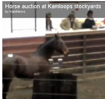
Thoroughbred – Kamloops, BC Feb 2011

The winter months are particularly bad for neglected horses because they can't graze on pasture. Denied necessary sustenance and in a weakened condition, these horses are often just loaded onto trailers and shipped off to auction for sale to the kill buyers.