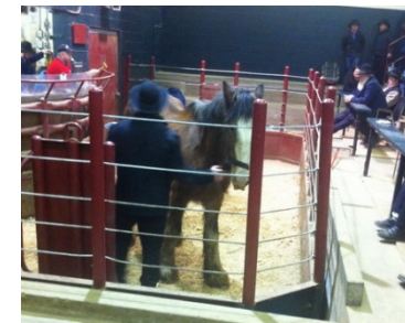
Blind Clydesdale Mare OLEX 2012