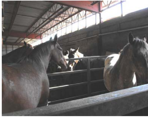
Beautiful discarded horses – kill pen OLEX, ONTARIO 2011

Their conditions vary greatly. Some horses are in excellent health showing that they had good care before ending up at auction. Sometimes their owners are present fussing over them and looking for buyers who will provide good homes.