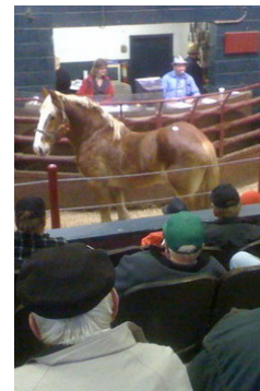
Belgian – OLEX 2009